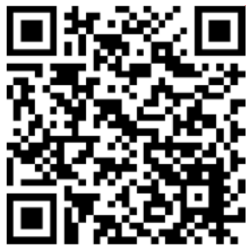
MS- Power Point